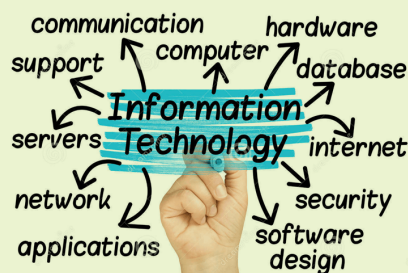
Fig. 1: Features of IT

created on the market through the utilization of PC and web. From the info travelling within the fibre optics within the type of 0's and 1's (which is information btw) to the ever-increasing worldwide internet, info is all over. The utilization and process of knowledge for helpful functions are termed as Info Technology.